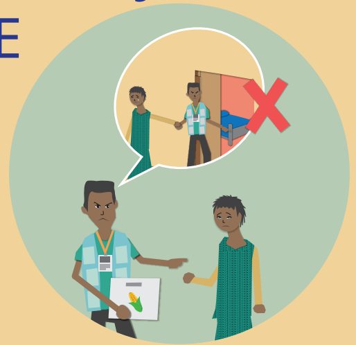
Taa hollu a wallitan ko wallinde ngam njeenu, musingo hunduko ko wayeeku.