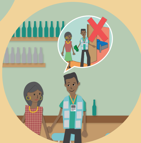
Taa yobanu njeenu.