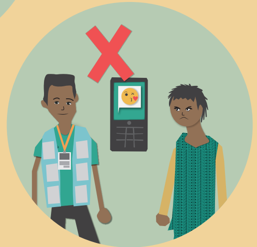
Taa yerbine bindi njeenu.