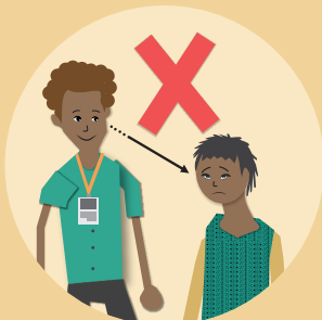
Taa waɗu darɗe.