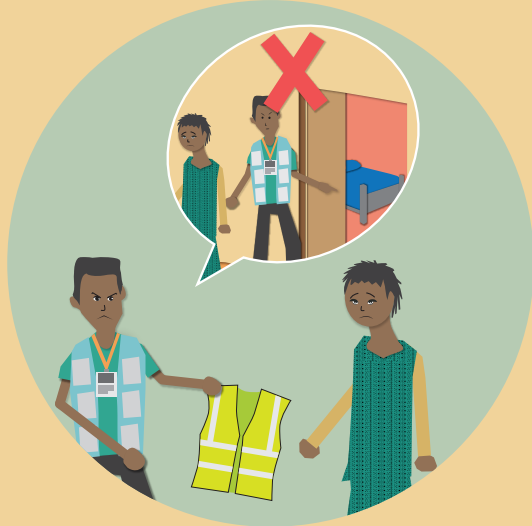
Taa waɗu njeenu be sembe.

Wala alkawal kuugal ngam be hokke njeenu, musingo hunduko, ko waye ku.