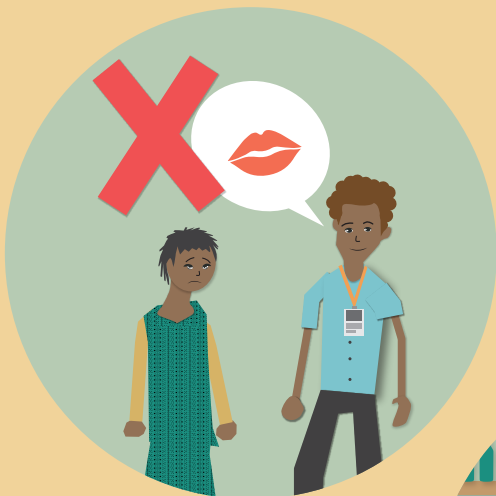
Taa takkindere hunduko.